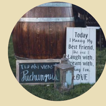
WELCOME DÉCOR Wooden Signs, Elegant Drapes, a Chandelier, Seasonal Flowers and More