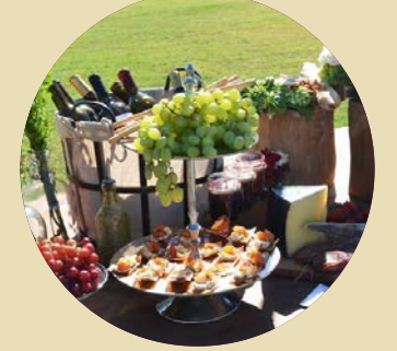
GOURMET SERVICES 3 Three-Course Menus to Choose From, an Open Bar with El Cielo Wines and More