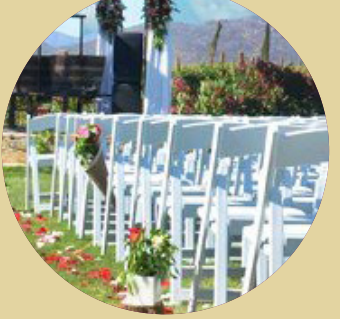
24 White or Brown Avant Garde Chairs