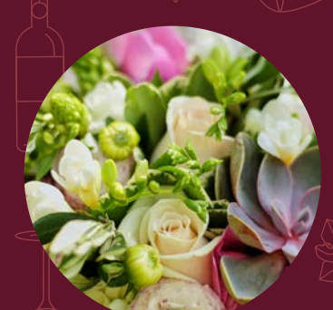
One Large Seasonal Floral Arrangement for Podium

Pillar Candles in Glass Cylindrical Vases to Mark Aisle