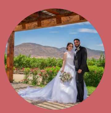
Romantic Vineyard Ceremony Location at El Cielo Winery & Resort

Professional Services of a Signature Wedding Designer™