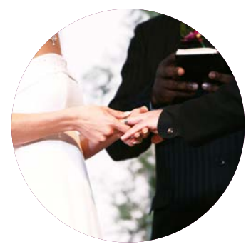
Non-Denominational Minister to Perform a Symbolic Wedding Ceremony