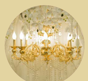
One Seasonal Floral Arrangement One Glass Chandelier or Fabric Sheers for Wooden Pergola