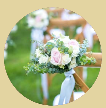
Four Seasonal Floral Chair Corsages