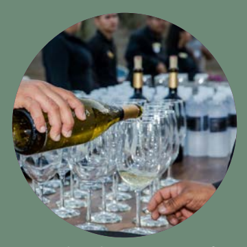
An El Cielo Wine Toast of Either Red, White or Rosé (2oz. Pour per Guest)

Groom's Boutonniere with Seasonal Flowers