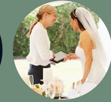
Expert Signature Wedding Designer™