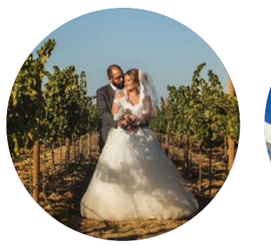
Vineyard at the Resort Romantic Ceremony Location