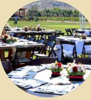
TABLE DÉCOR Elegant Linens and Chairs, Seasonal Floral Centerpieces, Coordinated Menus and More