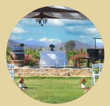
White Altar Table or Podium with White Linen