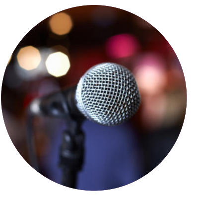
Sound System with Wireless Microphone