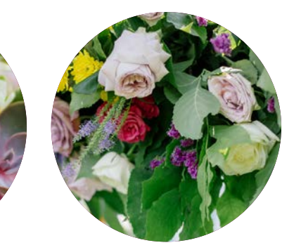
Four Seasonal Floral Bouquets to Mark the Aisle