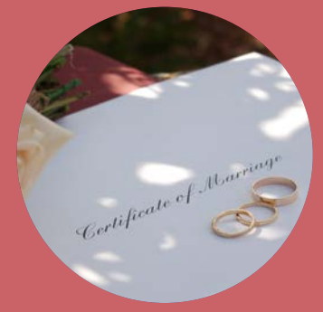
Symbolic Wedding Certificate