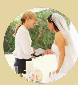
Expert Signature Wedding Designer