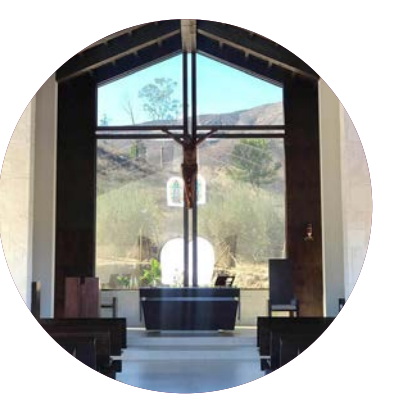
Wooden Pew Seating for Up to 120 Guests