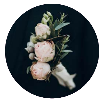
Groom's Boutonniere with Seasonal Flowers

THE ROBUST CEREMONY WEDDING PACKAGE PRICE: $2,950 USD