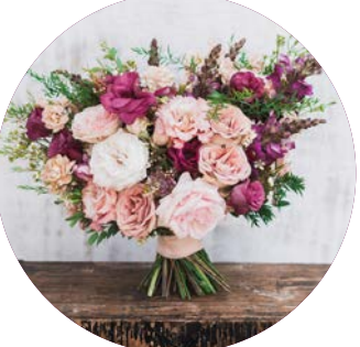
Bridal Bouquet with Seasonal Flowers