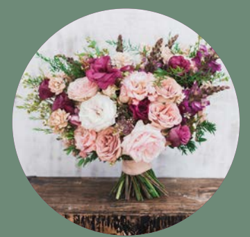
Bridal Bouquet with Seasonal Flowers