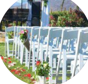
24 White or Brown Avant Garde Chairs