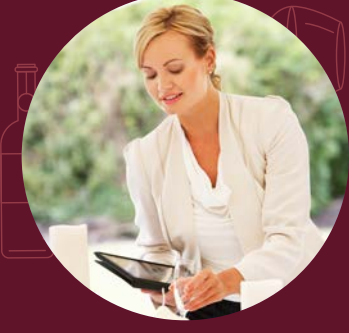
Onsite Wedding Coordinator on the Day of Your Wedding

Expert Signature Wedding Designer<sup>™</sup>