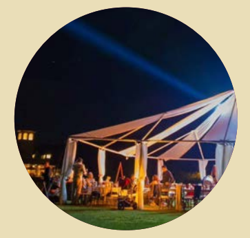
ENTERTAINMENT & ADDITIONAL SERVICES 4 Hours of DJ Service, a Signature Wedding Designer™ to Help Coordinate It All and More