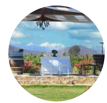
White Altar Table or Podium One Seasonal Floral with White Linen Arrangement on Gazebo