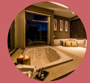
Romantically Decorated Suite with Rose Petals, Aroma Therapy and Candles the Night of the Ceremony