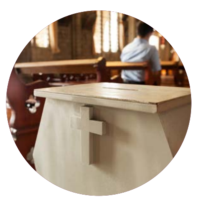
Donation Fee for Catholic Church to Perform a Catholic Ceremony