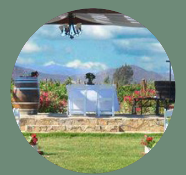
White Altar Table or Podium with White Linen