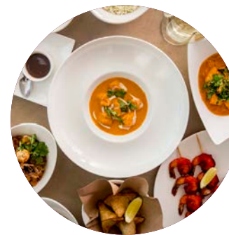
Gourmet South Asian Food Display Prepared by Chef Thushara