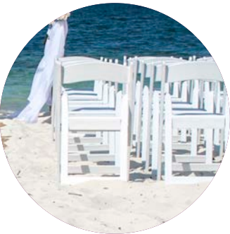
White Avant Garde Uncovered Chairs for Guests