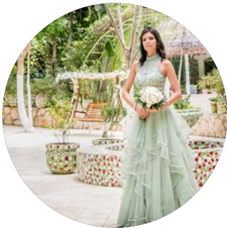
Romantic Ceremony Location at Xolumado Inspirational Village

Bring your vision to life with a destination wedding ceremony that is not only an authentic reflection of this coveted tropical destination, but also of you as a couple. With all of the services and amenities that come with the Secret Garden Celebration Ceremony at Xolumado Inspirational Village by Karisma, you will have everything you need to tie the knot – and then some.