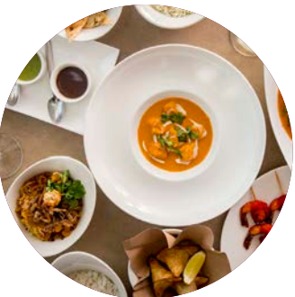
Food Display Expertly Prepared by South Asian Gourmet Chef, Chef Thushara