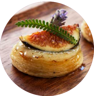
Groom's Room with Gourmet Bites