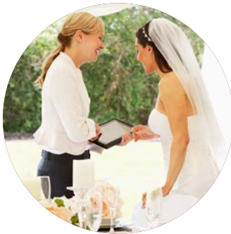
A Dedicated, Onsite Signature Wedding Designer™, Certified in South Asian Weddings