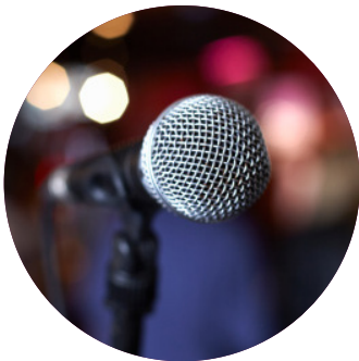
Sound System with Wireless Microphone