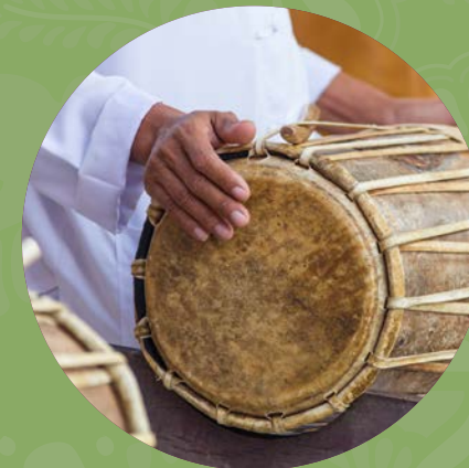
Dhol Drum Player (45 Minutes)