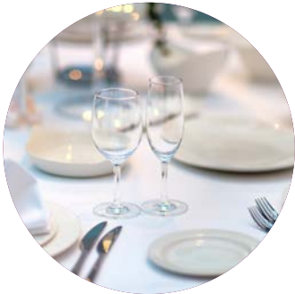
5 Round Tables Decorated and Set for 10 People