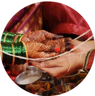
Non-Denominational Minister & Symbolic Wedding Certificate