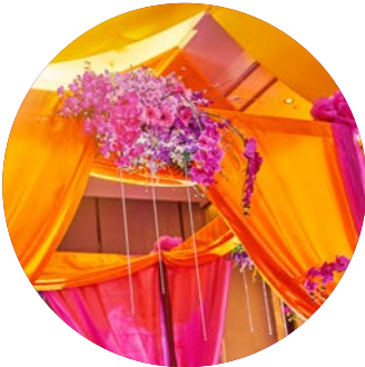
Stunning Stage Area with Colored Backdrop and Seating for Two

Surround Yourself with Luxurious Décor, Delicious Delights, and Exciting Entertainment with These Secret Garden Celebration Reception Inclusions