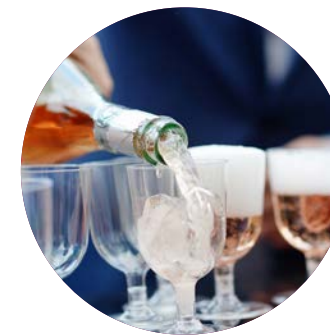
4-Hour International Open Bar