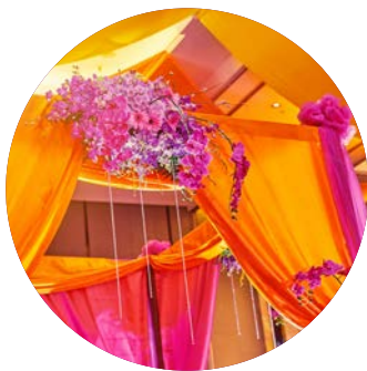
Vibrant Stage Area with Back-drop Draping and Elegant Seating for Two

Make Your Big Day Even More Memorable with These Sangeet Ceremony Inclusions