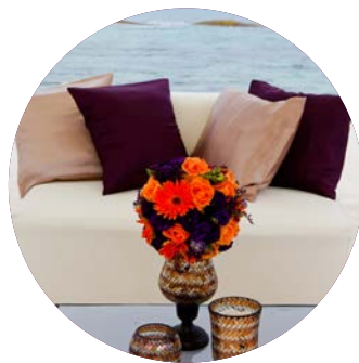
Three Sets of Lounge Furniture