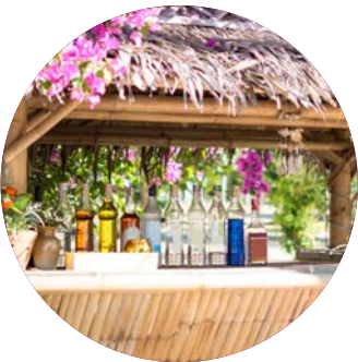
Beverage Station Offering a Selection of Cold, Hibiscus Infused Water, Lime Water, Tea, and Soda Throughout the Ceremony