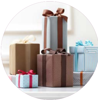
Free Wedding Website & Honeymoon Gift Registry