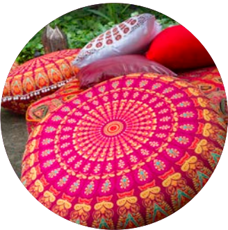
Choice of Pillows or Tiffany Style Chairs for Family Members Participating in the Ceremony