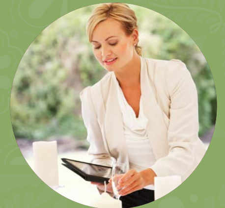
Onsite Signature Wedding Designer™ to Organize and Direct the Processional