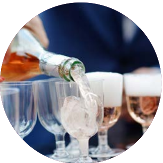
Private International Open Bar Throughout the Reception