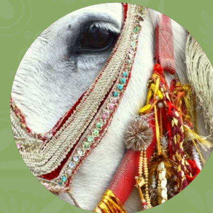
Horse in Traditional Garb for Baraat Processional

The Greatness of Your Love Will Be Honored with These Baraat Processional Inclusions