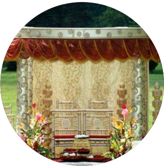
Spectacular Wedding Mandap Decorated with Colorful Backdrop and Draping Sheers