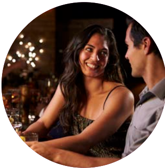
Memorable Moments Honeymoon Package