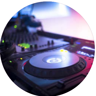
4 Hours of DJ Service